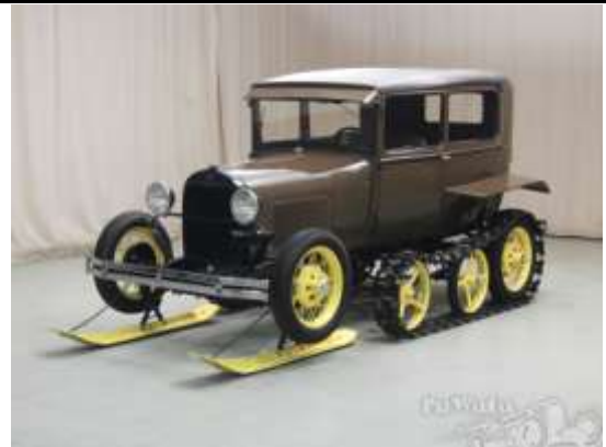
1929 Model A Ford "Snowbird"